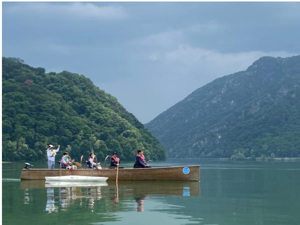
Chuncheon Uiamho Lake King Canoe