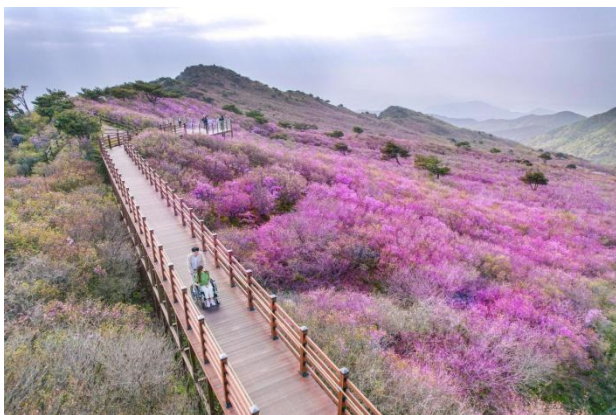
Daegu Biseulsan County Park