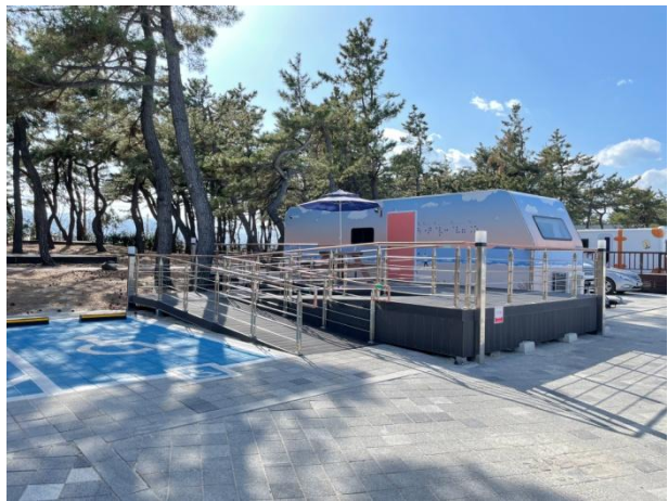
Gangneung Yeongok Beach Campground (Universal Design Caravan)