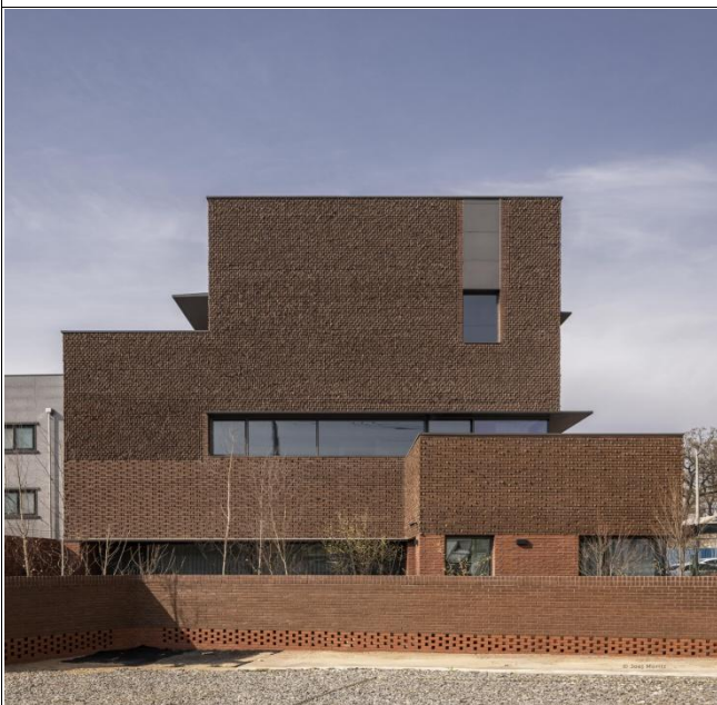
ARC MOMENT (Detached house, Seoul)