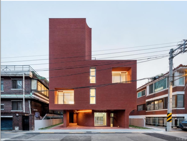
MOTTAGI 99 (Multifamily housing, Seoul)