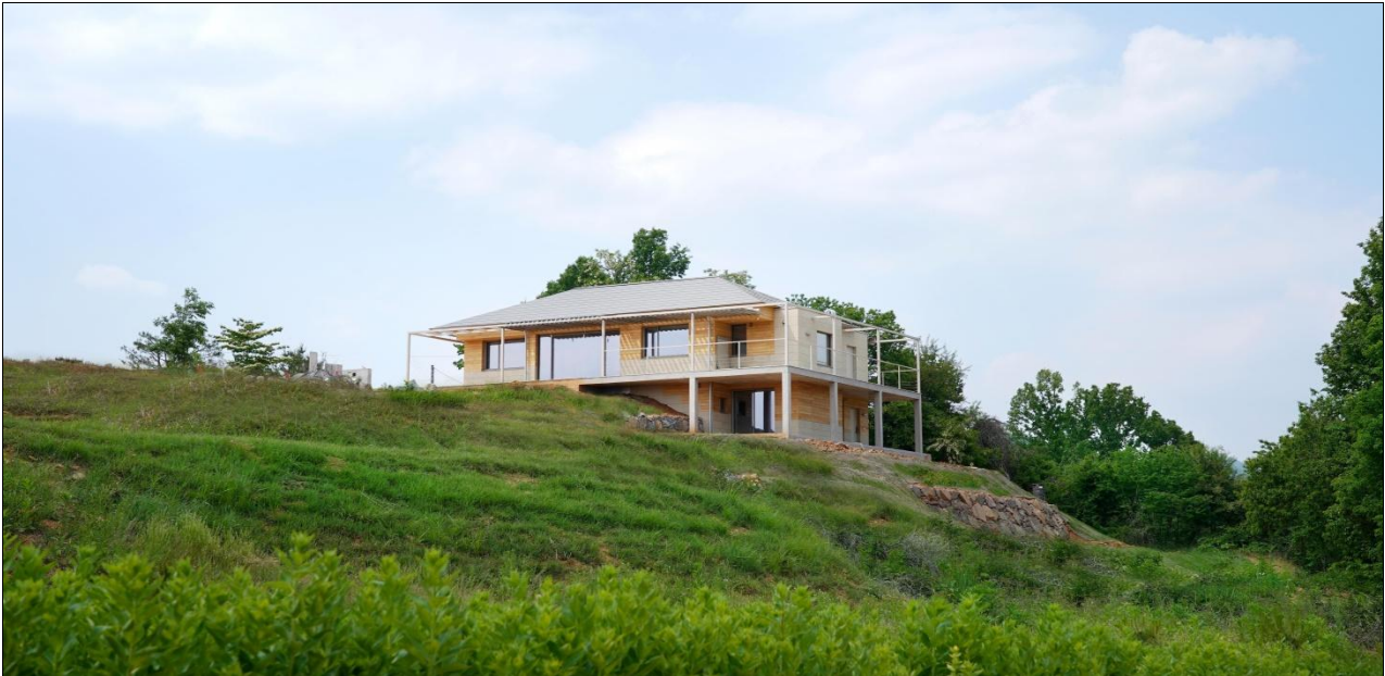
A House by a Lake (Detached house, Jecheon)