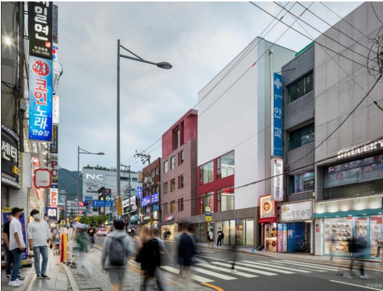
PROJECT RE-INTERPRET (Commercial building, Busan)