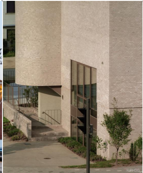
PROJECT YP (Commercial building, Yangpyeong)