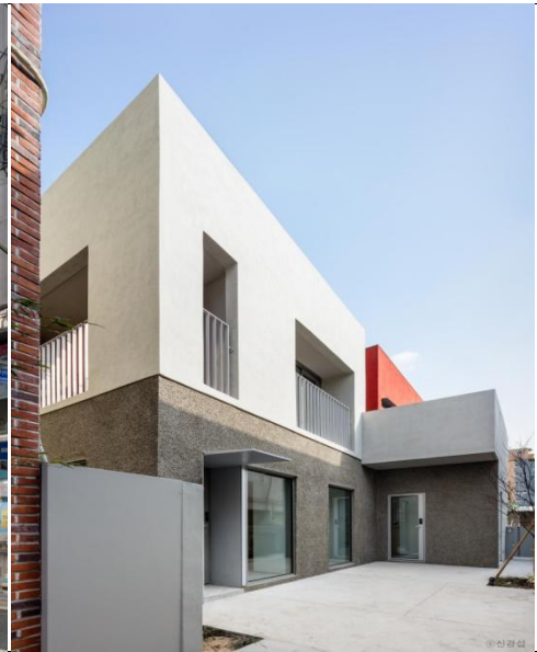
CONCRETE LIBRARY (Detached house and commercial building, Busan)