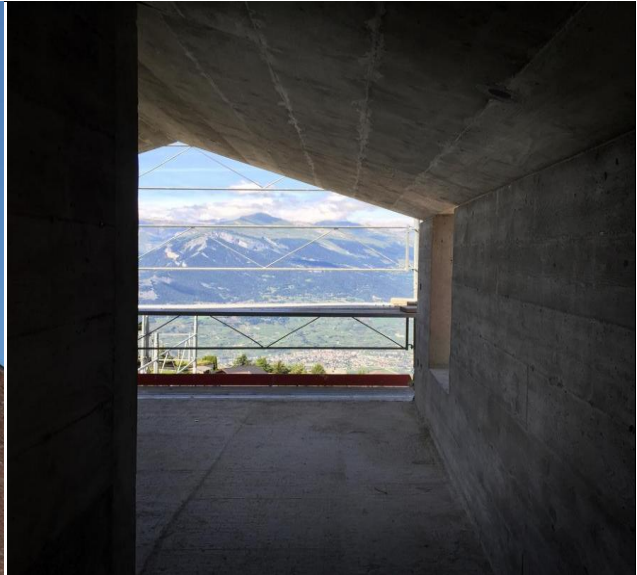
Chalet à Pracondu (Detached house, Switzerland)