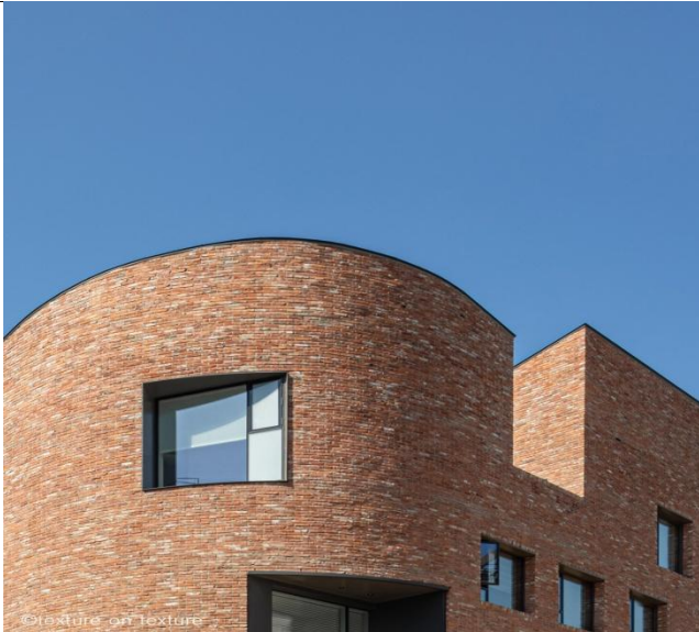
EED (Multifamily housing and commercial building, Suwon)