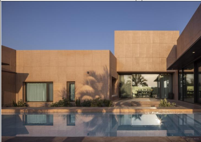
SURIUM (Accommodation, Jeju)