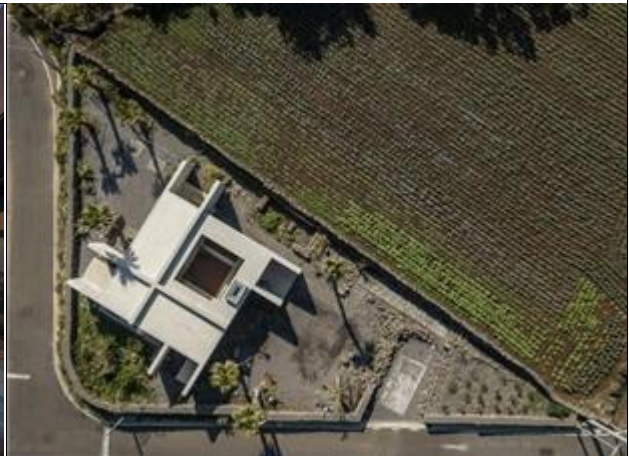
NASILLONNER PJT (Detached house, Jeju)